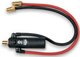
195380 50 mm Dinse-style gas thru with gas and water return lines for water-cooled torch.