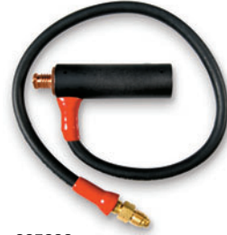
225028 50 mm thread-lock-style for water-cooled torch.