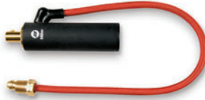
195377 50 mm Dinse-style with water return line for water-cooled torch.